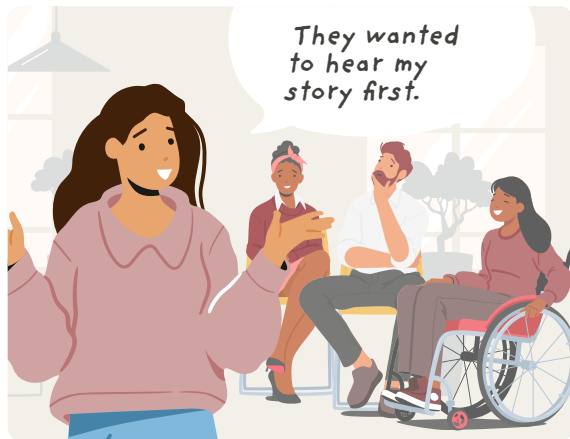
We started by listening.