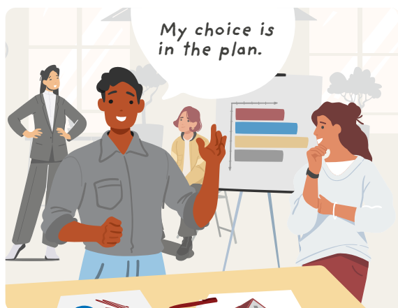
We chose what matters most.