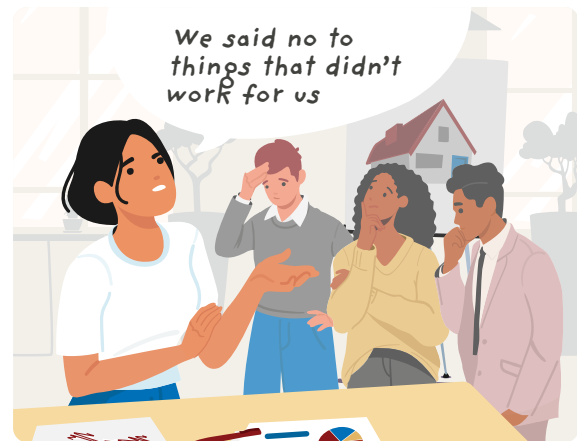
We challenged assumptions.