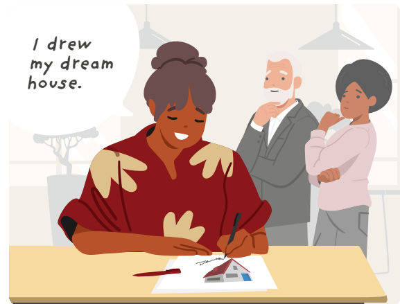
We shared our stories and dreams.