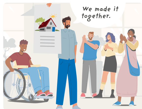
We shaped a new direction for Karis.